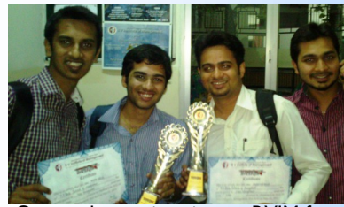
Our students win prizes at RVIM fest