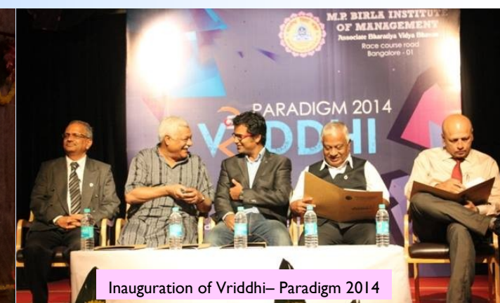
Inauguration of Vridhhi— Paradigm 2014