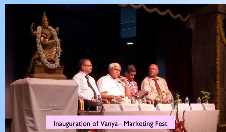
Inauguration of Vanya— Marketing Fest

Before you start some work, always ask yourself three questions - Why am I doing it, What the results might be and Will I be successful. Only when you think deeply and find satisfactory answers to these questions, go ahead. - Chanakya